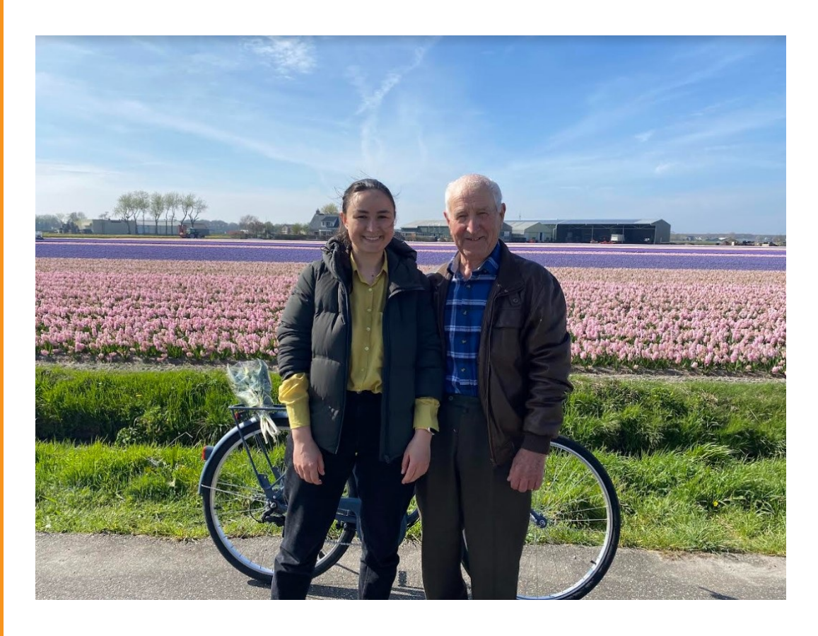
From Netherlands to Moldova: Digital skills connect family generations