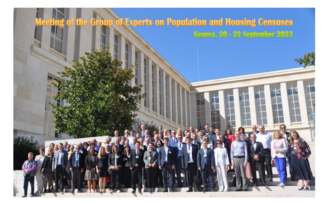
The Moldova progress towards population and housing census of 2024 profiled during Census Week in Geneva

The experience of the National Bureau of Statistics of the Republic of Moldova in preparing the population and housing census of 2024 was presented during Census Week, held in Geneva, Switzerland, from 18 to 22 September, under the aegis of the United Nations Economic Commission for Europe (UNECE) and the United Nations Population Fund (UNFPA). The Republic of Moldova was represented by a delegation including representatives of the National Bureau of Statistics, UNFPA Moldova and the National Institute of Economic Research.