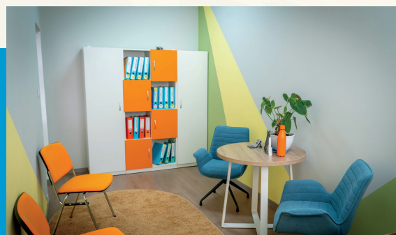
School psychologist's office